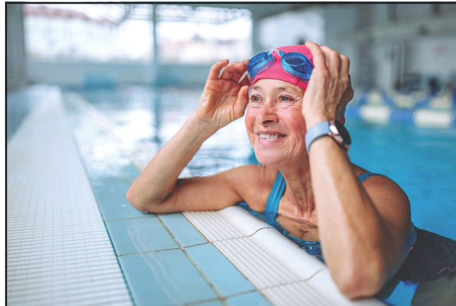
METRO CREATIVE CONNECTION

• Reduces body fat: Swimming can help many people slim down. According to Harvard Medical school, a 155-pound person can burn about 432 calories swimming versus about 266 calories walking at a