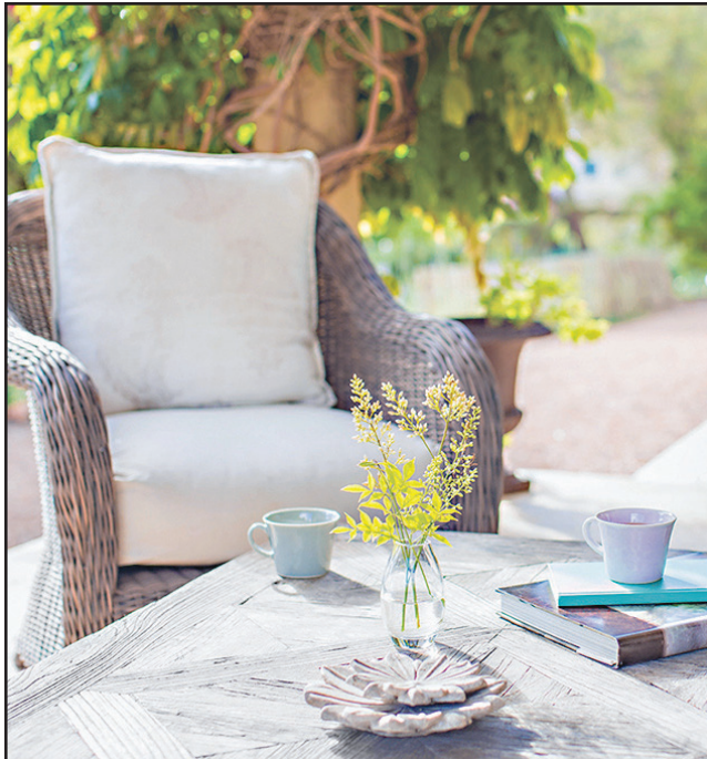
METRO CREATIVE CONNECTION

Some simple cleaning strategies make it easy to brighten outdoor furniture.