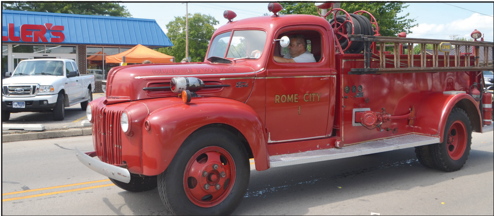
This vintage Rome City fire truck was an entry in the 2023 Chautauqua Days parade. This year’s parade is in downtown Rome City.