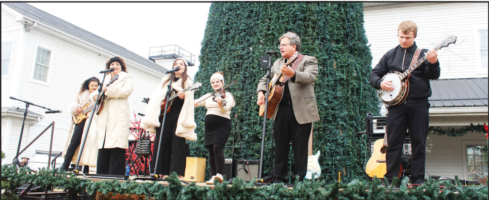
Nashville bluegrass band Williamson Branch performs in front of the Christmas tree on Middlebury Street.