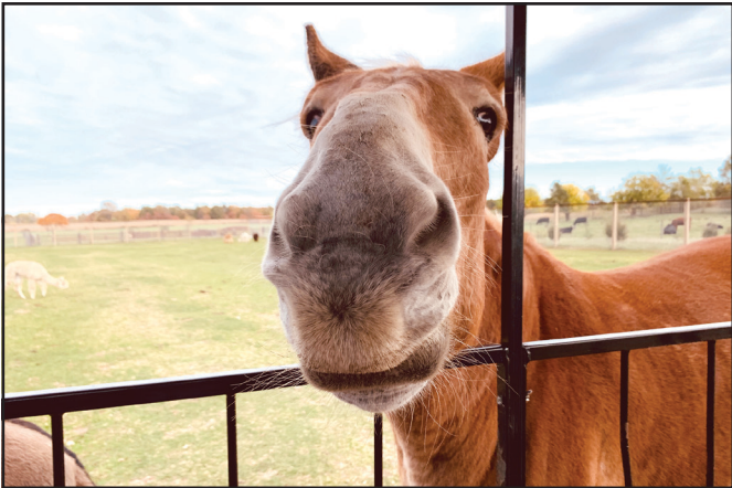
Horses will remain as part of the Dutch Creek Farm Animal Park attraction when it reopens in May.