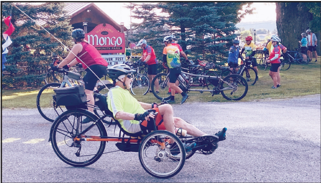
Bicycles of all types can be seen mainly in LaGrange County during the two-day Amishland and Lake bike tour. These riders are heading in and out from the support and gear station in Mongo.