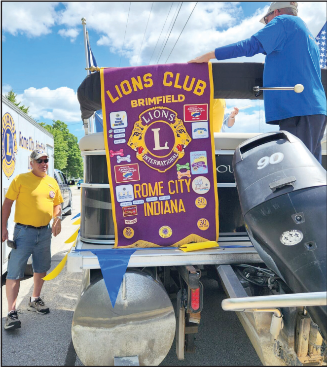
Members of the Rome City-Brimfield Lions Club attach a parade banner to a pontoon boat on a trailer in preparation for the Chautauqua Days parade in Rome City. The Lions club rides on the pontoon through the parade route, with the trailer pulled by a pickup truck.