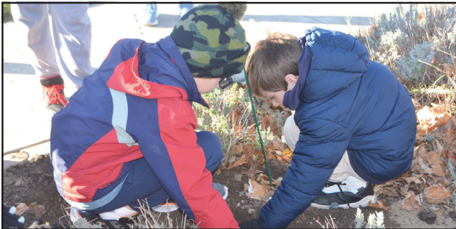
Two students from the Rome City National Elementary Honor Society place white crocus bulbs in a “bouquet” planting in the garden at Sylvan Lake Public Access Site. Honor society students and Advance Rome City adult volunteers nestled the spring bulbs among the existing plants.