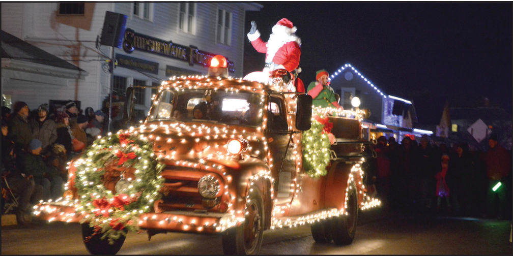
Santa Claus is carried in a past Shipshewana Christmas Light Parade. This year's event will be held on Saturday, Nov. 8, at 7 p.m.