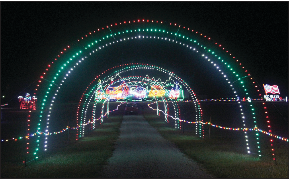
A giant mountain cabin scene illuminates the horizon beyond a glimmering drive-through archway at the Lights of Joy in Shipshewana.