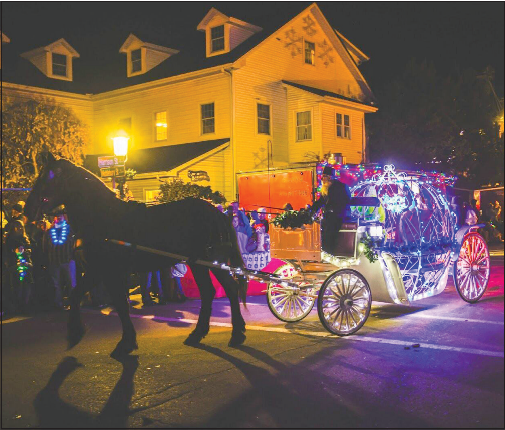
A magical carriage is pulled by a horse in the Shipshewana Light Parade.