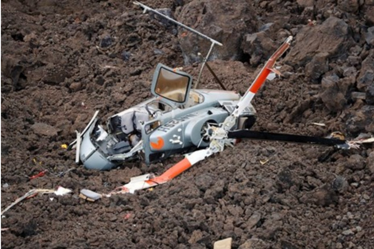
Figure 1. Main wreckage in lava-covered terrain

An investigator from the National Transportation Safety Board's (NTSB) Alaska Regional Office, along with an NTSB airworthiness investigator, an NTSB survival factors investigator, and an NTSB maintenance investigator from Washington, D.C., responded to the island of Hawaii.