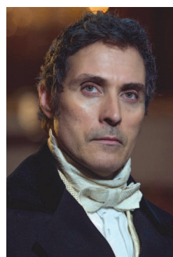
Rufus Sewell as seen in "Victoria"

Enter Prince Albert of Saxe-Coburg and Gotha (Tom Hughes, "Cemetery Junction," 2010), the choice of Victoria's