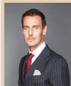
Ingo Rademacher stars in "The Bold and the Beautiful"

Anna tells Hope the truth. Eli questions Gabi about the night of Andre's murder. Valerie confronts Lani in regards to her secret. JJ has good news to share with Julie. Chad and Abigail witness a heated moment between Vivian and Stefan. Rafe and Eli have questions for a new suspect in Andre's murder. JJ follows a new line of work. Valerie issues an ultimatum to Lani. Gabi is booked on murder charges. Brady and Eve share their first real date. Lani confesses something to Eli. Claire is interested when she realizes Ciara and Tripp are keeping a secret. Will and Paul spy on John and they find