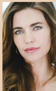
Amelia Heinle stars in "The Young and the Restless"

The families of Salem come together to celebrate Christmas. Someone unexpected visits JJ. Eli realizes he's made a big mistake. A Christmas miracle affects the townsfolk. Lani looks for answers about the night Theo was shot. Andre and Chad make a deal regard-