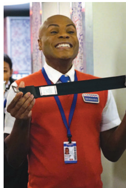
Nathan Lee Graham as seen in "L.A. to Vegas"