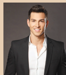
Robert Scott Wilson stars in "Days of Our Lives"

JJ discovers the results of the Internal Affairs investigation into Theo's shooting. Abe receives bad news about Theo. Ciara has a heartfelt conversation with Hope. Kayla shares a warm moment with Tripp. Will asks Paul if they can be friends. Eve overhears an argument between Brady and Victor. John gives Marlena a romantic gift. Kate and Eve fight over Gabi's company.