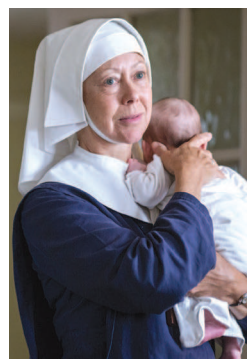
Jenny Agutter as seen in "Call the Midwife"