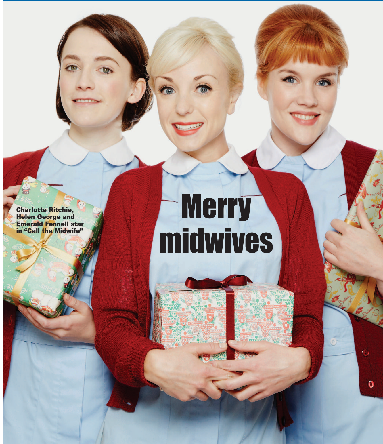
Charlotte Ritchie, Helen George and Emerald Fennell star in "Call the Midwife"