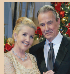
Melody Thomas Scott and Eric Braeden in "The Young and the Restless"

Stefan comes to see Abigail in a new way. John tells the truth to Marlena, Kayla and Steve. Paul and Will struggle to get free, but their situation has brought them closer. Tripp bonds with Ciara. Billie is rushed to the hospital. Ciara and Tripp find themselves in serious danger. Kayla attempts to keep something from Steve. A hostage situation turns deadly. Steve has a heartwarming reunion with