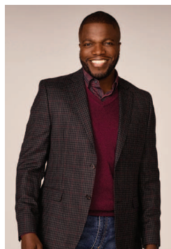
Reno Wilson stars in "Good Girls"

When it all becomes too much, these mommas and best friends devise a master plan: rob the local supermarket and walk away with $30,000. Things go a little too easily, however, and the ladies wind up with a lot more dough than they'd an-