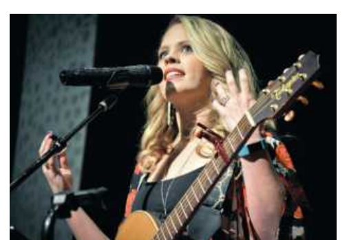
NAN DICKSON I SPECIAL TO FME NEWS SERVICE

Tucker picked up her guitar, sang a few bars of "God Bless the USA," and then thrilled the crowd with a rendition of