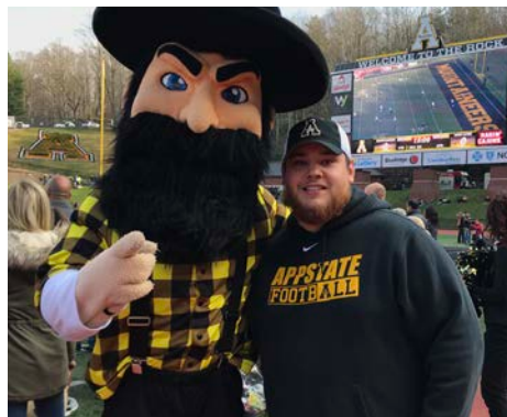
Country music star Luke Combs, who attended App State, poses with Yosef on the field during the 2017 home finale against Louisiana.