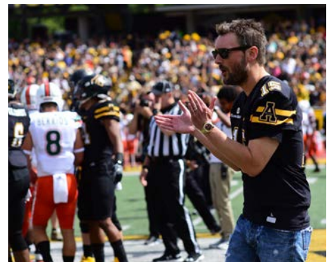
Country music star Eric Church, who also attended App State, participated in the pregame coin toss before the 2016 home game against Miami.