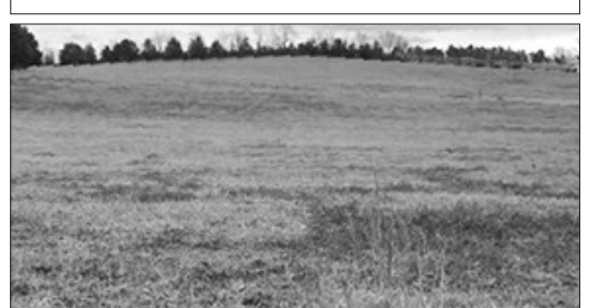
28.5+/- ACRES IN LIMESTONE Country setting with mountain views at the top. Gently rolling landscape becoming level near the road. Large pond at back of property. Call Berkshire Hathaway today for more information, $427,500 MLS 9946947