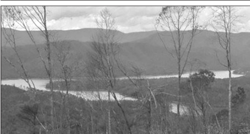
WATAUGA LAKE VIEWS Two properties available on Lakeview Drive in Butler. Approximately 5.49 or 5.87 acres of wooded privacy with great views. Call Berkshire Hathaway Greg Cox Real Estate for more information $269,200 each 9945359 and 9945360