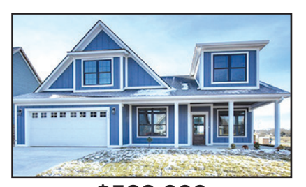
$599,000 165 Slonaker Circle Jonesborough

This fully renovated home is modern and chic at an affordable price point. 3 bedrooms, 2 full bathrooms, over 1,600 finished square feet in a fabulous location! MLS# 9945818