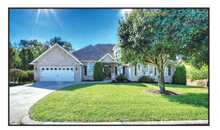
$895,500 I 14 Stonebrook Loop Elizabethton

Investors: This is your moment! This all brick 6 unit complex sits on 1.2 acres right on Boones Creek Rd facing the interstate - each unit has 2 bedrooms and 1 full bath. This is a rare find! MLS# 9947750