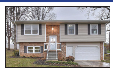
$289,900 102 Edgewood Drive Greeneville

Beautiful home in Carroll Creek Estates with over 2,900 finished square feet featuring 4 bedrooms and 3.5 bathrooms and a 2 car main level garage. MLS# 9945970