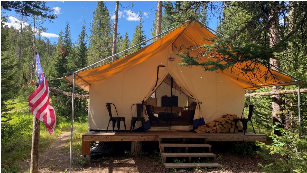
Figure 1. North Fork of Fall Creek Base Camp platform tent.

The Jackson Ranger District of the Bridger-Teton National Forest (BTNF) is seeking your input on the Fall Creek A-OK Corral Permit Relocation project, located about 10 miles southwest of Jackson, WY. BTNF has received a proposal from A-OK Corral, (A-OK) to move their outfitter and guide operations from their current location at Horse Creek to the North Fork of Fall Creek and assume the existing outfittering and guiding authorizations in the area. The proposal includes moving day horseback rides from Horse Creek to Fall Creek, continuing the overnight horseback riding trips (progressive travel) and hunting currently authorized at Fall Creek, and using and improving the existing base camp area along the North Fork of Fall Creek.