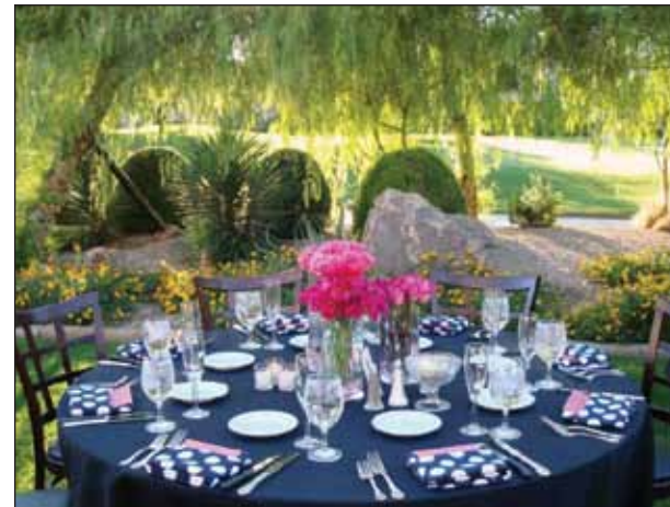
Starfire Golf Club