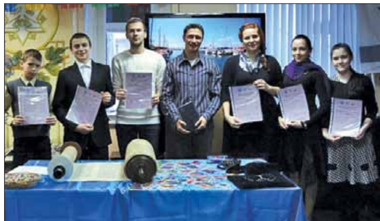
The seven participants in the Murmansk Bar/Bat Mitzvah, organized by The Jewish Agency, each recited a passage from the weekly Torah section of Bo in the book of Exodus.

The small Jewish community of Murmansk numbers only a