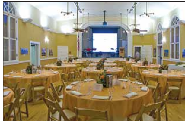
Cutler Plotkin Jewish Heritage Center

The Starfire Golf Club is a north Scottsdale event venue that overlooks the verdant, Arnold Palmer-designed public courses. Parties can be held indoors or outdoors, and the food and beverage staff will help design a menu to delight adults and teens alike.