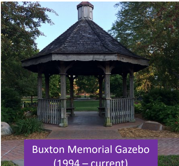
Buxton Memorial Gazebo (1994 – current)