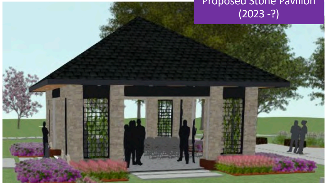
Proposed Stone Pavilion (2023 -?)