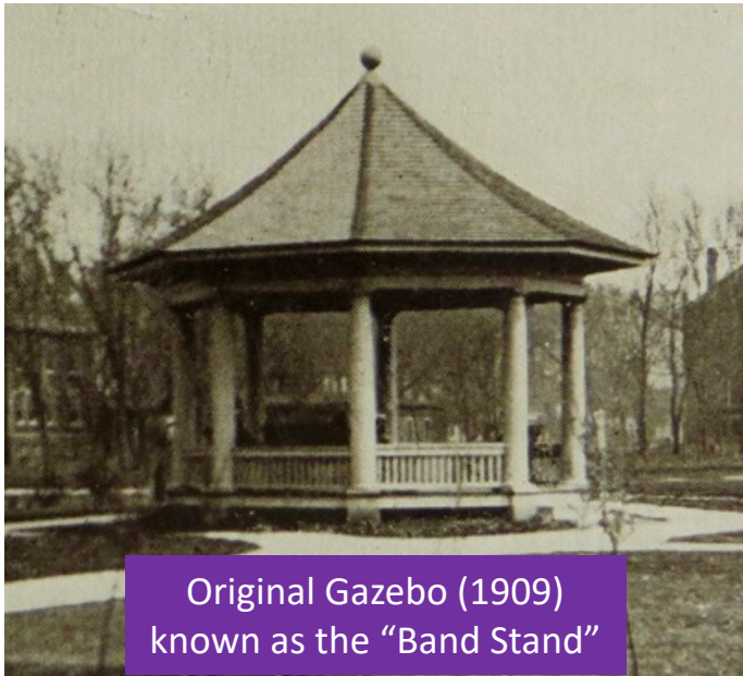
Original Gazebo (1909) known as the "Band Stand"

A gathering place and a fountain have always been key fixtures in Buxton Park, offering visitors a destination, place for connection, conversation and perspective on the beauty and life in and around them.