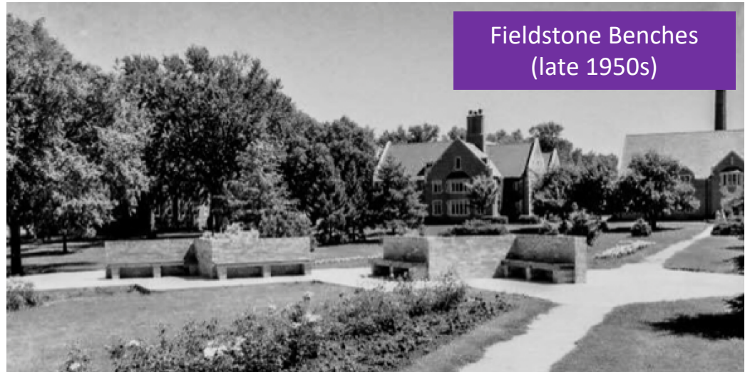
Fieldstone Benches (late 1950s)