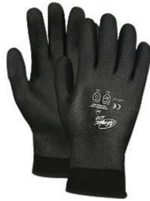
Memphis Black Ninja® Coated Gloves

Already registered for Airgas/NPP savings? Log in here to shop.