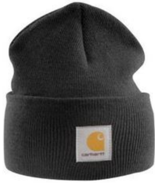
Carhartt® Acrylic Rib-Knit Watch Hat