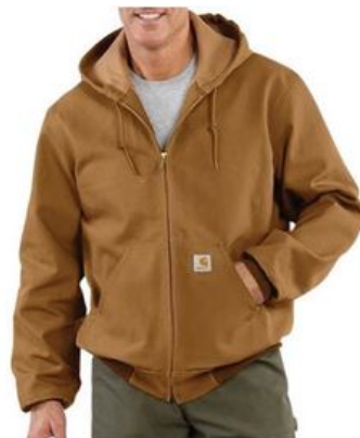
Carhartt® Thermal Lined Duck Active Jacket