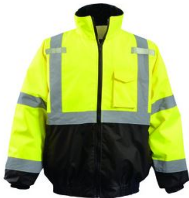
Radnor® Hi-Viz Waterproof 2-in-1 Jacket