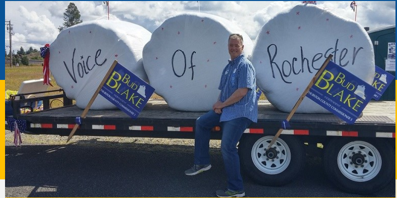
Celebrating Swede Days in Rochester

Thurston County Commissioner District #3 August 2016 Issue #4