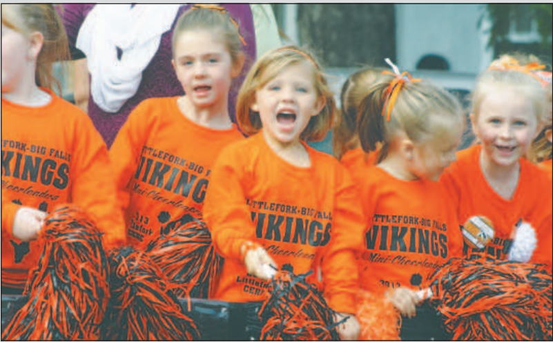
A group of mini cheerleaders entertain crowds with cheers.