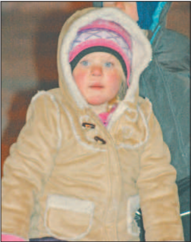
A child’s eyes widen as Santa Claus passes by during Friday’s parade.