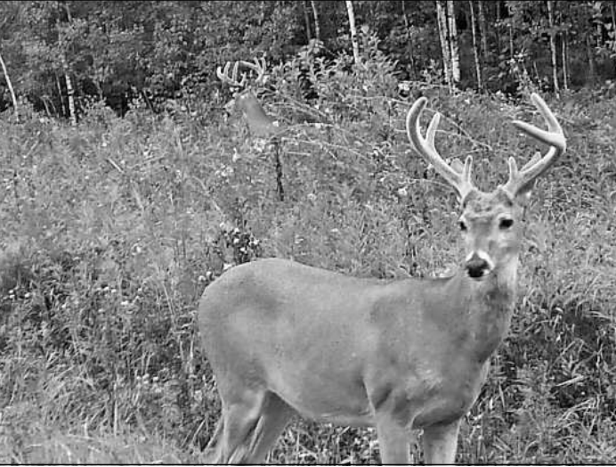
Minnesota's deer hunting season doesn't start until Nov. 8, but many area hunters are eyeing some bucks. These two bucks were captured in photographs taken out of the window of a vehicle by Brian McBride near his hunting shack.