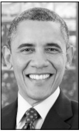
President Barack Obama

and an economic policy speech delivered from the picturesque Lake Harriet Bandshell on Friday. He’ll also spend time Thursday with a Minneapolis woman who wrote him a letter about financial hardships she’s encountered, the first in what the White House is describing as “day-in-the-life” visits. But presidential appearances inevitably take on strong political overtones, particularly in a year when Minnesota Republicans are intent on breaking a Democratic hold on all statewide offices and legislative con-