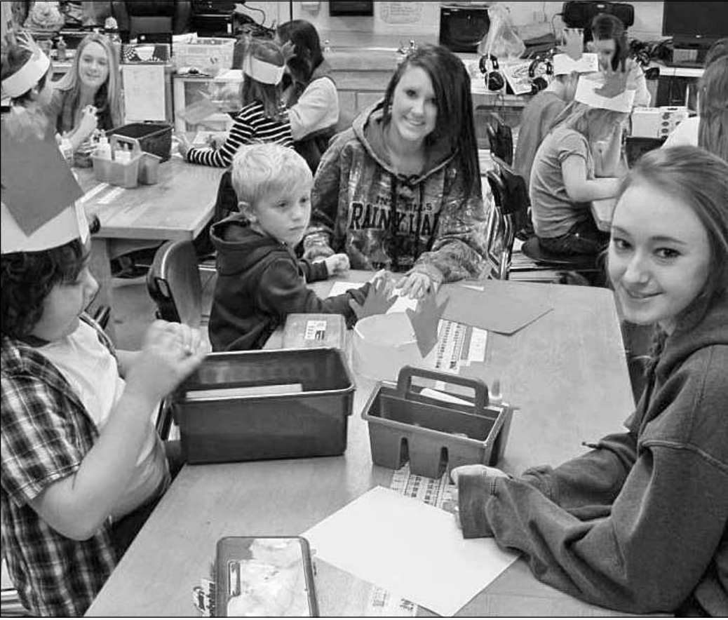
FACS students developed and taught many activities, and gained first-hand experience of the kindergarten stage of development.

According to school officials, both the high school students and the kindergartners benefited by this experience; the groups not only enjoyed their time together, but also learned from each other.