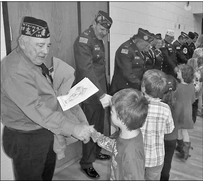
CONTRIBUTED PHOTOS Veterans line up to be greeted by students and staff as they left the gym to go outside and observe the flag raising ceremony.

STRAIGHT A'S The Journal welcomes ideas for stories about students from and in our community. Call the Journal at 285-7411