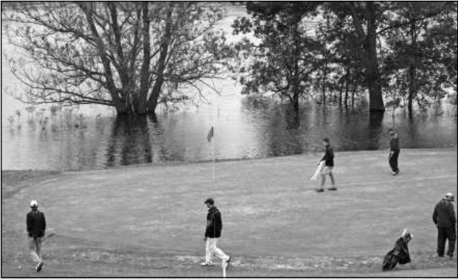
High water along the Rainy River behind the green on hole No. 8 at the Falls Country Club didn’t prevent last weekend’s Smokey Bear Golf Invitational from taking place as scheduled.

top finishers in each flight that goes along with this are included in the chart story.