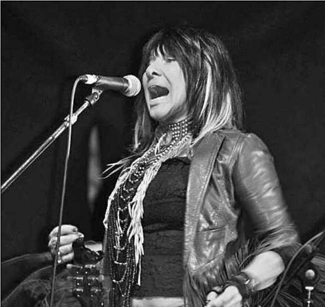
Academy award winner Buffy Sainte-Marie took center stage Saturday night as the headliner for the Harmony of Nations Music Festival in Fort Frances. The Canadian music legend was among the 18 artists who performed throughout the first-ever event.