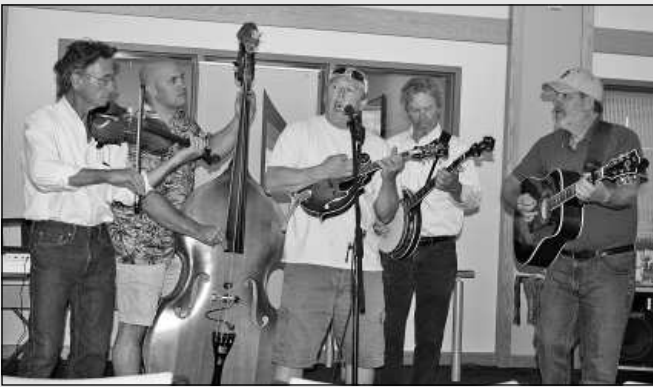
The WoodPicks, Thief River Falls, perform a mix of gospel, bluegrass, country and Americana Saturday during a workshop at the Fort Frances Public Library Technology Center in conjunction with the inaugural Harmony of Nations Music Festival. During the workshop, the band took time to teach some local musicians how to play a bluegrass tune.