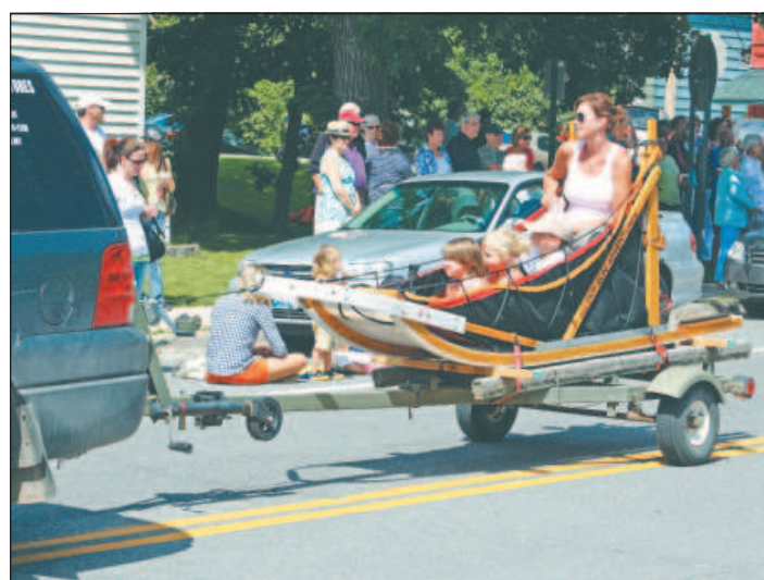
Above: Silent Run Adventures also brought along this larger sled to the parade.