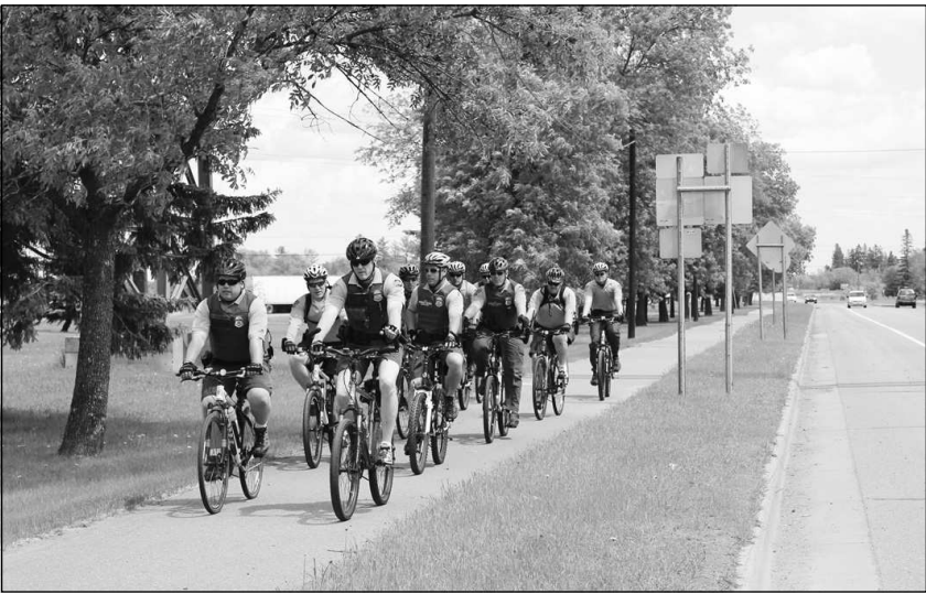
Border Patrol agents ride the bike path along Highway 11 East last week during bike patrol training.

course was completed last week at the U.S. Customs and Border Patrol station on Highway 11 East and commemorated with a photograph of agents standing with their bikes in front of the building.