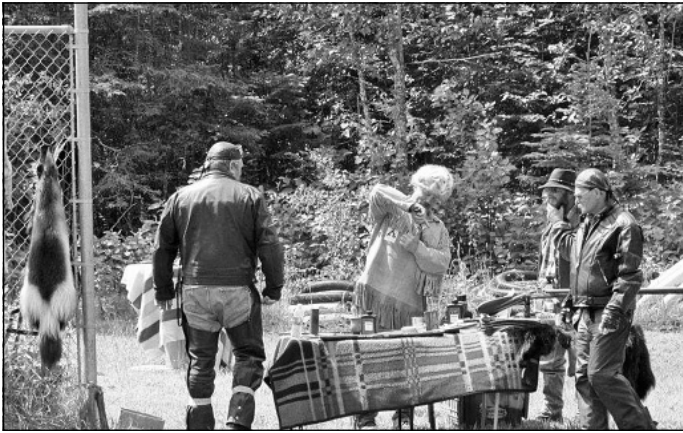
Black powder demonstrations have proved to be a Pioneer Days favorite over the years.