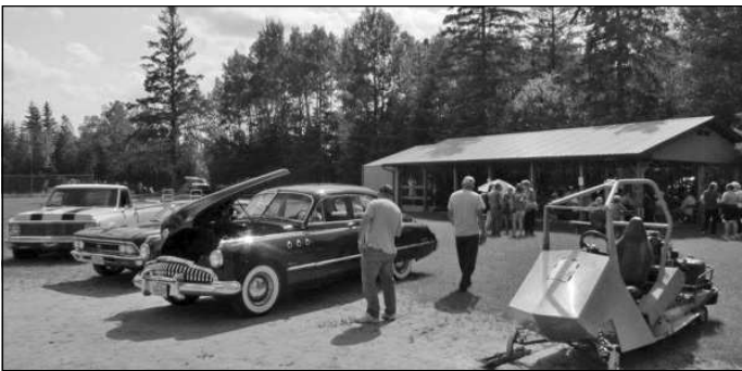
Several antique automobiles and even a snowmobile line up for festival goers to view Saturday.