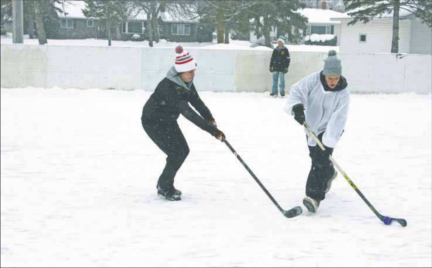
Snow flurries Saturday afternoon don't stop players in the boot hockey tournament at the Eighth Street rink.