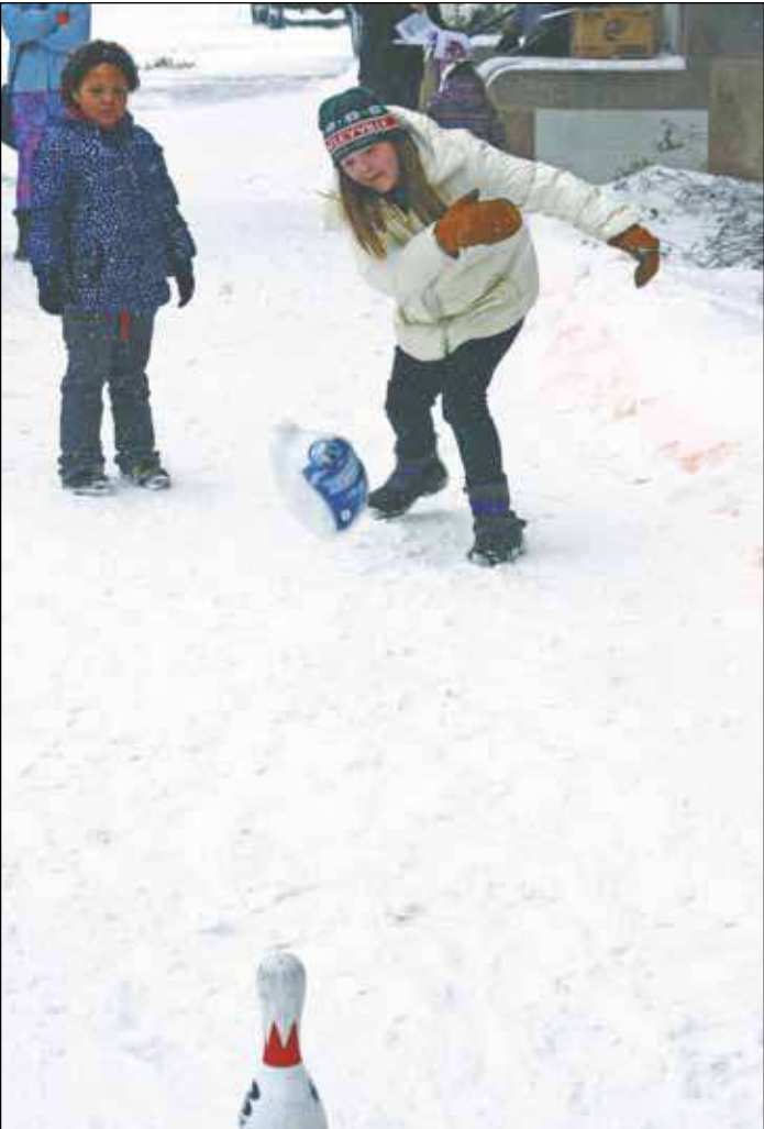
Fresh snow makes for some tricky turkey bowling during Icebox Days Saturday.