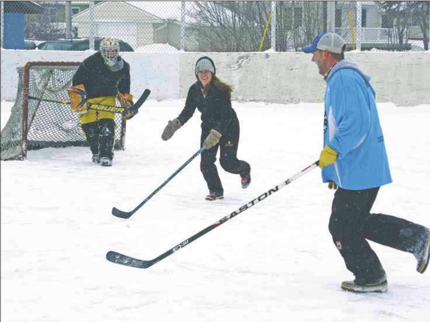
Players battle for the ball during a boot hockey tournament game Saturday.