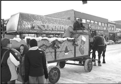
Take an Old-Fashioned Wagon Ride Friday 3:30-6:30 p.m.

7 P.M. ‘Twas the Lights Before Christmas Parade (Register floats, vehicles, animals or walkers until last minute! Forms available at the Chamber, required. 283.9400)