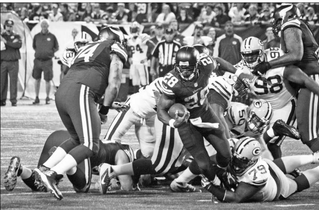
Vikings running back Adrian Peterson (28) is tackled by Packers defensive tackle Ryan Pickett (79) in Sunday night’s game at the Metrodome. Peterson rushed for 60 yards a touchdown in Minnesota’s 44-31 loss to Green Bay.

ers in 2012. Over the last three weeks, he has only 150 yards.