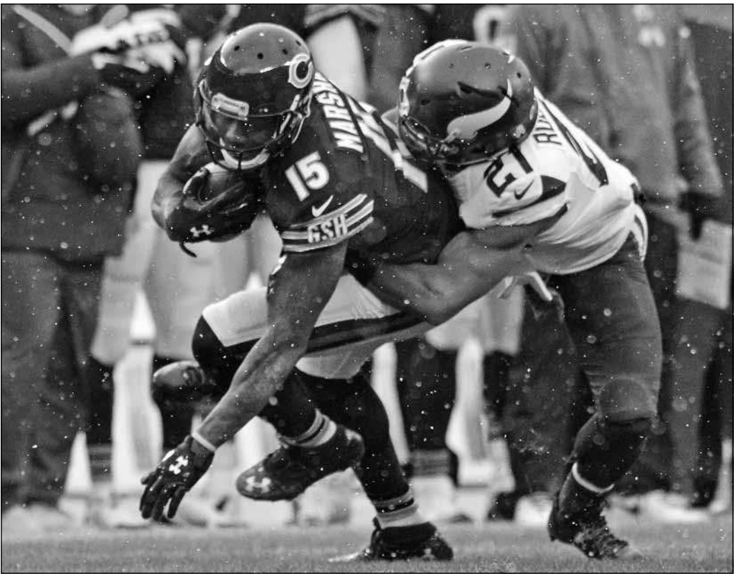
From left, Bears wide receiver Brandon Marshall (15) is tackled by Vikings cornerback Josh Robinson (21) in Sunday's game at Soldier Field.

thony Barr, who has had an otherwise-stellar first season, missed several tackles. Jay Cutler passed for 330 yards, by far the most allowed by the Vikings in 2014. He even ran for 21 yards.