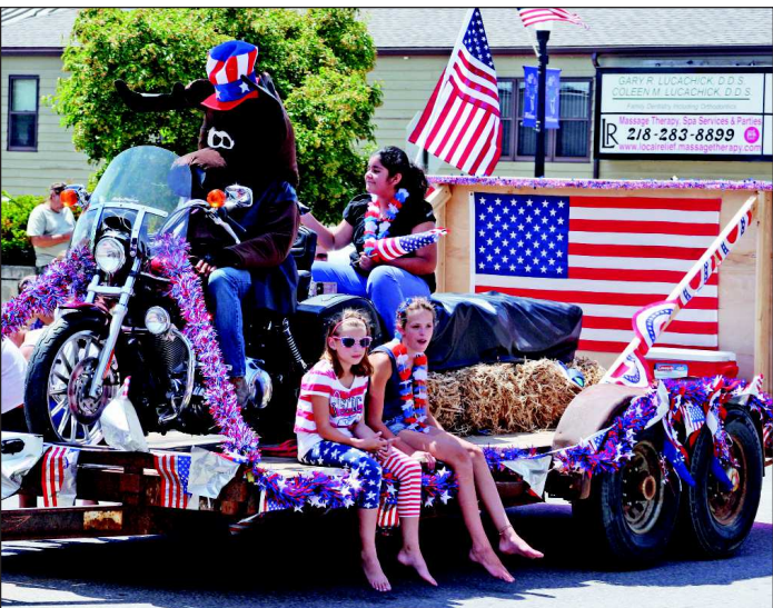
This moose-on-motorcycle float was one of the more creative floats in the Fourth of July parade.