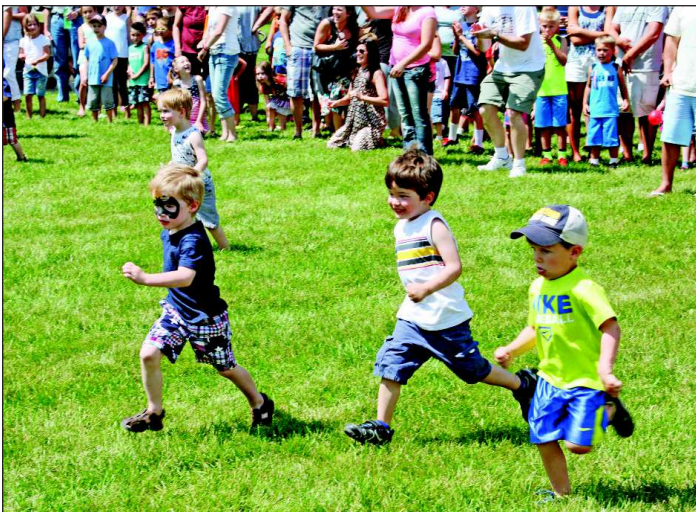
Fourth of July festivities at Smokey Bear Park featured races for the younger children.