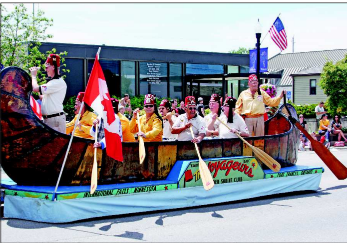
The Voyageurs Shrine Club paddles their canoe down Third Street Friday at the Fourth of July parade.