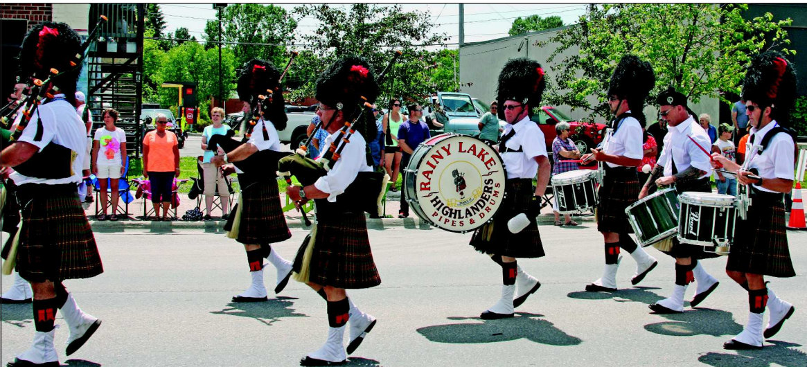
The Rainy Lake Highlanders march down Third Street playing a tune Friday at the Fourth of July parade.