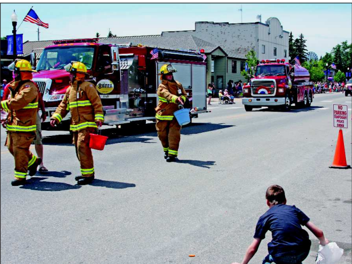
International Falls Fire Department members throw candy to youngsters lining Third Street during the Fourth of July parade.