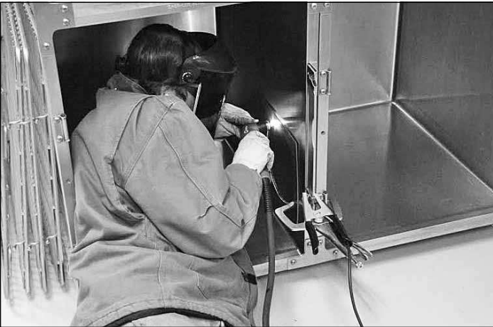
The experience at the humane society gave students some hands-on learning, while helping out the newly-opened facility.