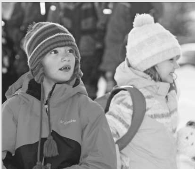
Students gaze up at the iconic Christmas figure waving from the roof of Falls Elementary School.

Santa Claus paid a visit Friday to students at Falls and West End Elementary schools. Children looked up in amazement as the jolly elf waved from the roof of their schools. Several students quizzed Santa on if he knew their names, what they wanted for Christmas and the whereabouts of his reindeer. After spending a chilly hour on top of the schools, Santa visited each classroom handing out candy canes.