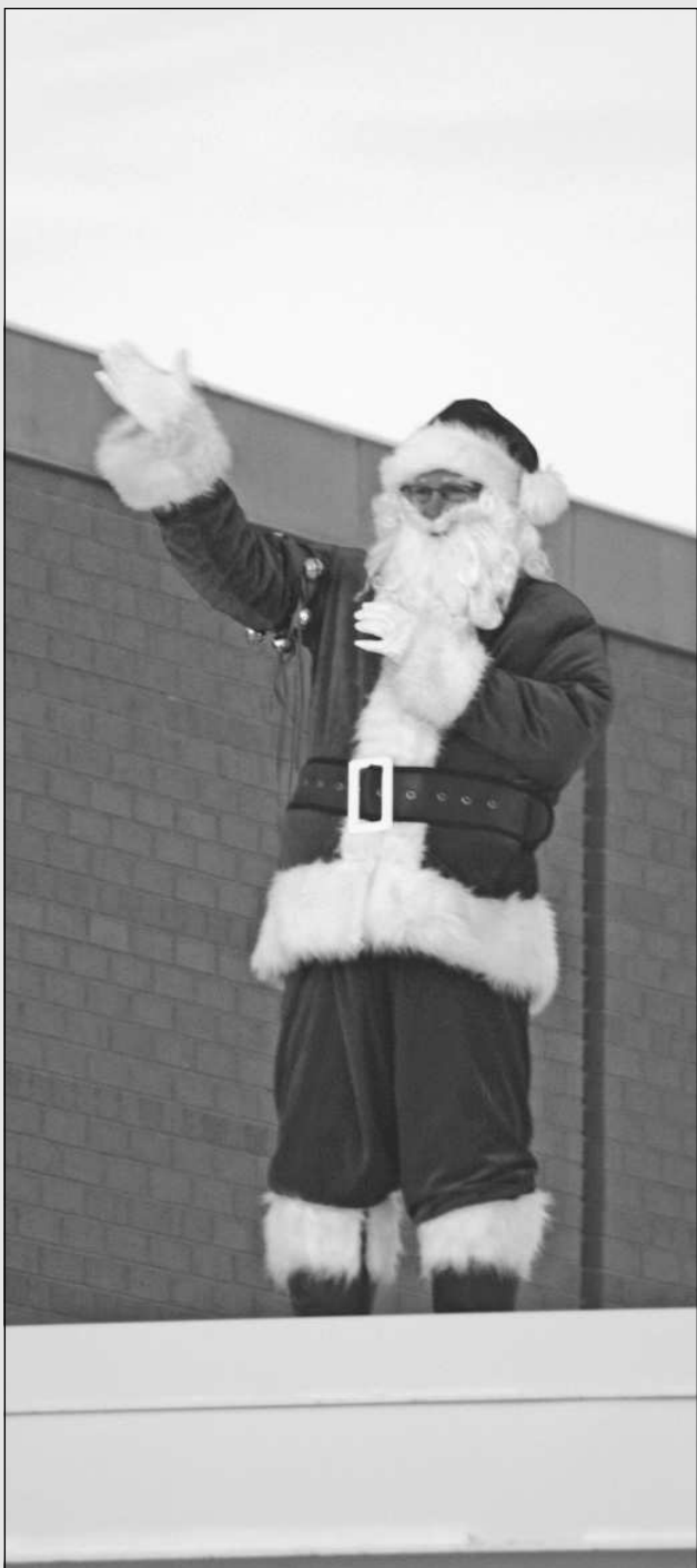
Santa Claus waves to students Friday as they arrive at Falls Elementary School.