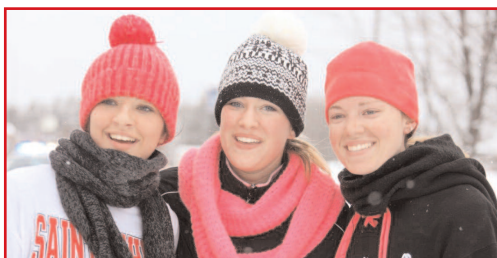
"Pretty" darn cold!