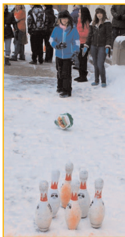
Turkey Bowling 2013