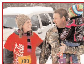
The FYGBR is a family affair.