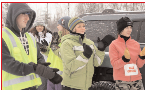
Race officials cheer runners past the finish line.