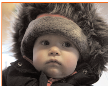
Bold and Beautiful