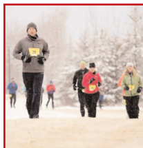
Runners of the FYGBR 2013