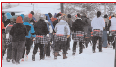
The double meaning of "Iceboxers".

Call 1-800-325-5766 or 218-283-9400 or register at www.freezeyergizzardrun.com