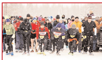
Above, start of the 10K FYGBR 2013