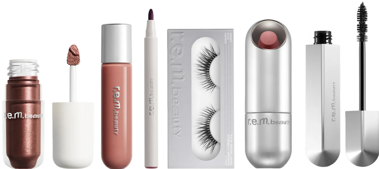
Showcased are a list of some of Grande's most popular products, including: liquid eyeshadow, plumping lip gloss, lip stain marker, lashes, matte lipstick, and mascara.