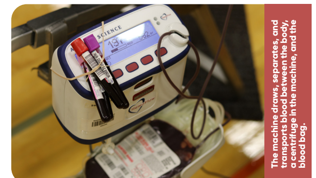
The machine draws, separates, and transports blood between the body, a centrifuge in the machine, and the blood bag.