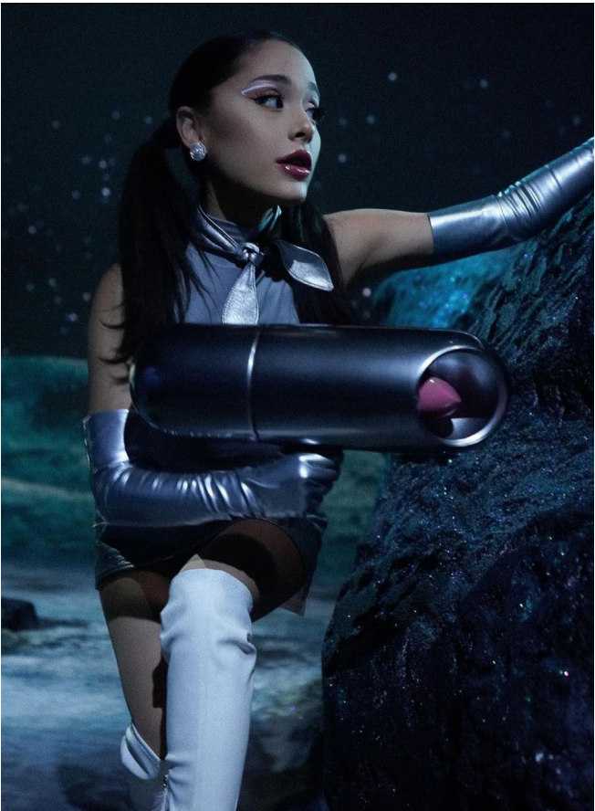
Ariana Grande stuns in her promotional cosmic set-up that showcases R.E.M. beauty on the moon.

It can be inferred that Ariana Grande is one of the most talented individuals of this generation. Her rise to fame since the 2010s have served her well with her experience in acting, singing, writing, and producing. Grande has taken the makeup industry to another level in engaging in what might've been one of her biggest years in her career, but also in the beauty industry. R.E.M. Beauty products can be ordered online at their very own website .