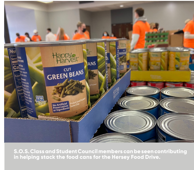
S.O.S. Class and Student Council members can be seen contributing in helping stack the food cans for the Hersey Food Drive.

Check out these videos to learn more about the impact the food drive has on our community by hearing from the local pantry workers and SOS class student members and a behind the scenes look on "Food Drive Day" Nov. 19.