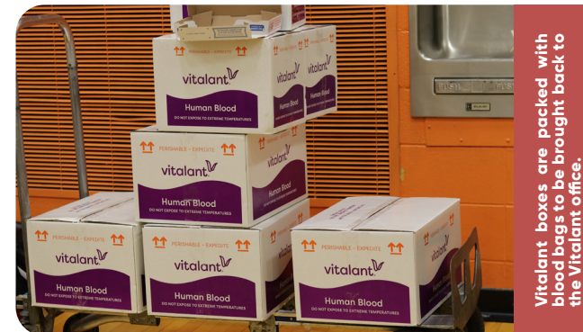
Vitalant boxes are packed with blood bags to be brought back to the Vitalant office.