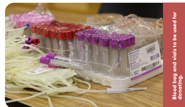
Blood bag and vials to be used for donating.