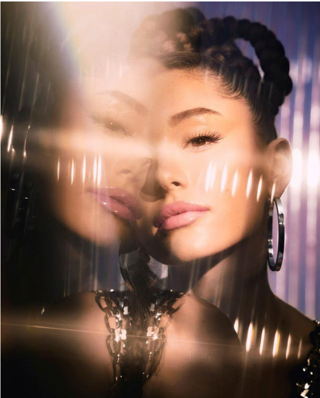
Ariana Grande looks glamorous in her photoshoot for Allure magazine to promote her new makeup line, R.E.M. Beauty.