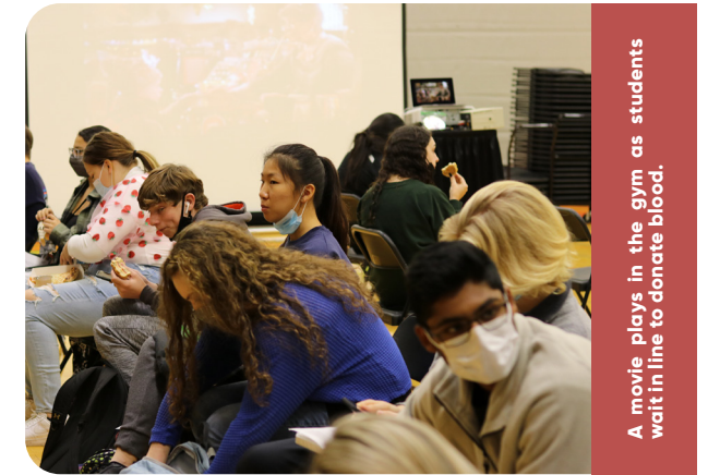
A movie plays in the gym as students wait in line to donate blood.