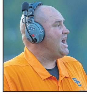
Chris Steger