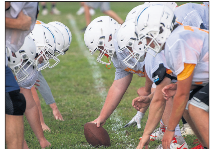
Sullivan Central will be looking for major contributions from its offensive line, the biggest unit the Cougars have had in some time.