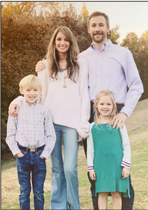
ABOVE: The Montgomery family.