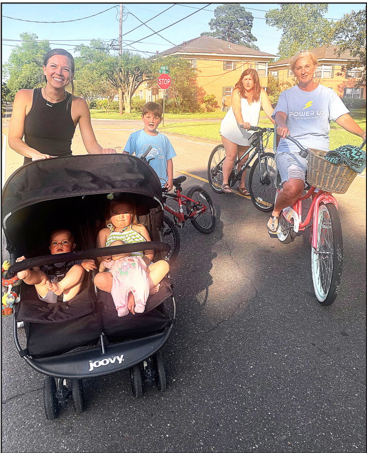
ABOVE: Three generations of the Gwinn girls with darling grandchildren.