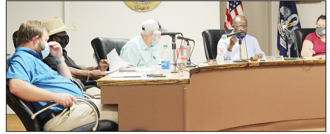
MEMBERS OF the Morehouse Parish Police Jury discuss road repairs at their regular meeting Aug. 9.

September, the one-month the roller arrives. rental will begin as soon as