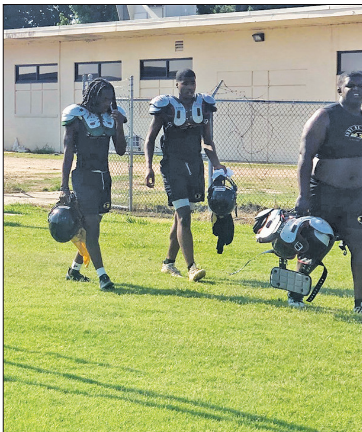
FERRIDAY PLAYERS head to practice Monday. The Trojans practice on the field behind the visitor's bleachers.

Kickoff at Missouri is slated for 7 p.m. and the game will be broadcast nationally on ESPNU. For complete coverage of Bulldog Football, please follow Louisiana Tech on social media at @LATechFB (Twitter), LATechFootball (Facebook), and @LATechFB (Instagram) or visit the official home of Louisiana Tech Athletics at LATechSports.com.