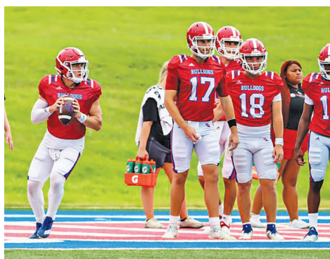
LA. TECH QUARTERBACKS.