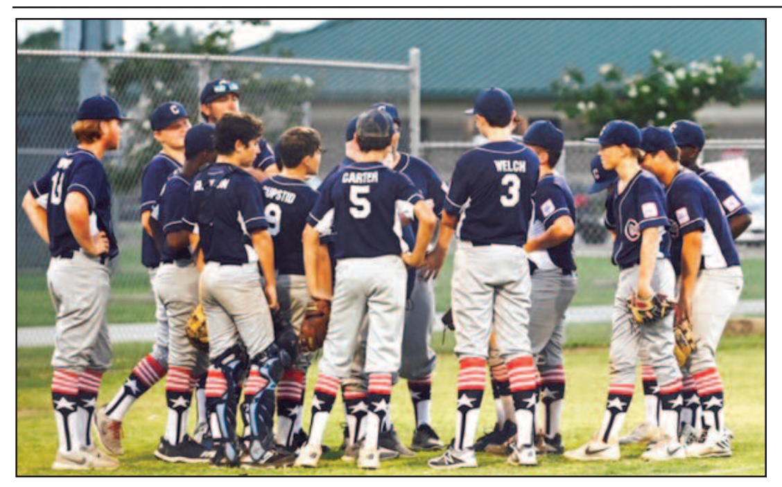
THE CONCORDIA DIXIE BOYS All-Stars meet on the mound during their district tournament held in Vidalia this past weekend.