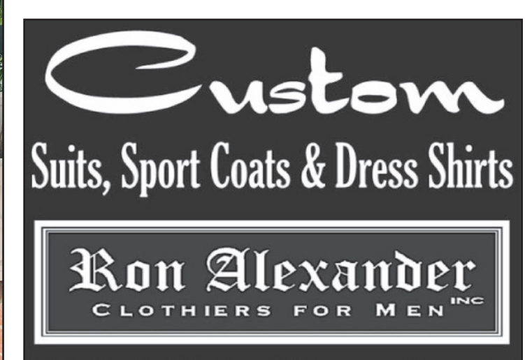
1615 North 18th Street, Monroe • 387-4409 www.ronalexanderclothiers.com