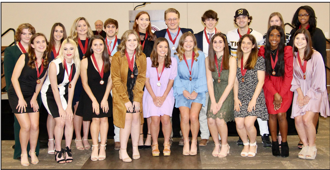
ABOVE: The top 120 Neville Tigers.