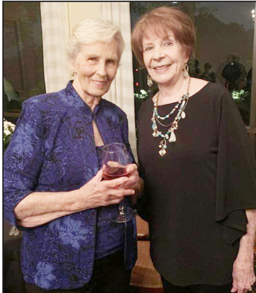
ABOVE: The class of 1954, Neville High School, held a fabulous reunion weekend that included a casual party, lunch, tours, Saturday evening entertainment and more.