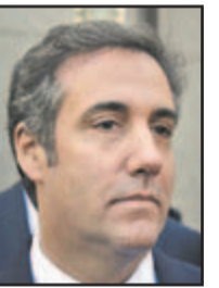
MICHAEL COHEN Secretly recorded conversations with then-candidate Trump in 2016

BRIDGEWATER, N.J. — Donald Trump said Saturday he finds it "inconceivable" that a lawyer would tape a client, as the president weighed in after the disclosure that in the weeks before the 2016 election, his then-personal attorney secretly recorded their discussion about a potential payment for a former Playboy model's account of having an affair with Trump.