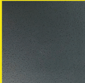
24" X 24" BLACK #152