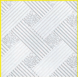
24" X 24" WHITE #996