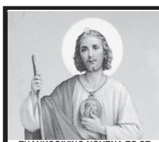
THANKSGIVING NOVENA TO ST. JUDE

Oh, Holy St. Jude, Apostle and Martyr great in virtue and rich in miracles, near kinsman of Jesus Christ, faithful intercessor of all who invoke your special patronage in time of need, to you I have recourse from the depth of my heart and humbly beg to whom God has given such great power to come to my assistance. Help me in my present urgent petition in return I promise to make your name known and cause yours to be invoked. Say 3 Our Fathers, 3 Hail Mary's, 3 Glories for 9 consecutive days. Publications must be promised. St. Jude pray for us all who invoke your aid. Amen. This Novena has never been known to fail. I have had my request granted. ABC