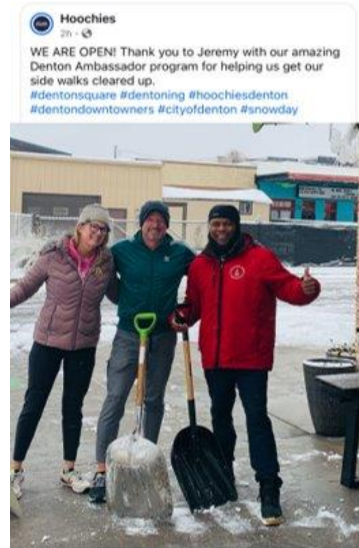
Jan. 2025: Block by Block Operations Manager deicing sidewalks downtown.