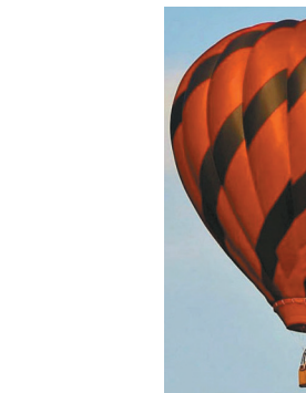
Denis Sutter Hallsville, Mo. Black Cherry