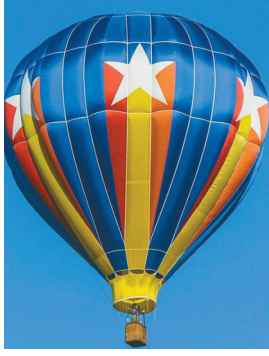
James Art Hodge The Villages, Fla. Star Rider