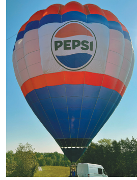
Pat Fogue Columbia, Mo. Pepsi