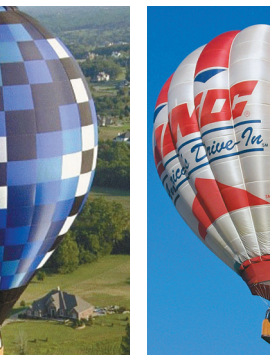
Clay Turner Decatur, Ala. Flight 847 The Misfit