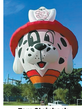
Tom Steinbock Crestwood, Ky. Fire Dog